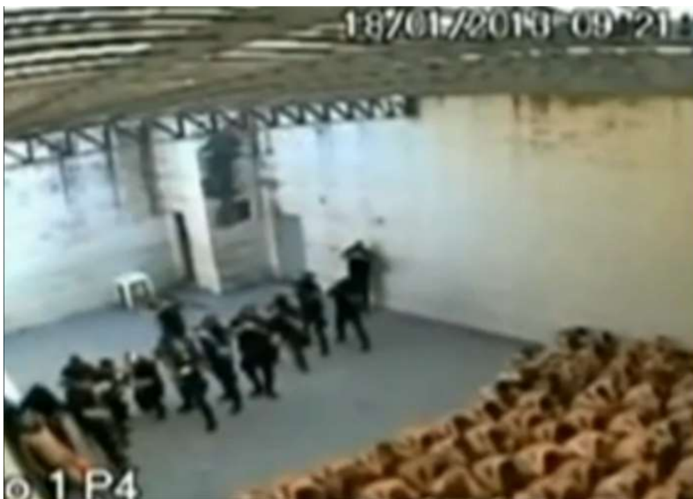
Screen shot of closed circuit video footage 113

Brazil: Closed circuit footage of a 2013 incident at the Joinville Regional Prison in Santa Catarina State received widespread media attention. 112 The footage shows officials, reportedly from the Department of Prison Administration, forcing a group of male detainees stripped down to their underwear to line up in tightly-packed rows, crouch down with their hands on their heads and face the wall. Behind the prisoners, a group of approximately 12 armed officials use kinetic impact projectiles and tear gas on the detainees, as well as spraying what appears to be a chemical irritant directly into their eyes. This behaviour is a clear violation of the UN CAT and the Inter-American Convention to Prevent and Punish Torture.